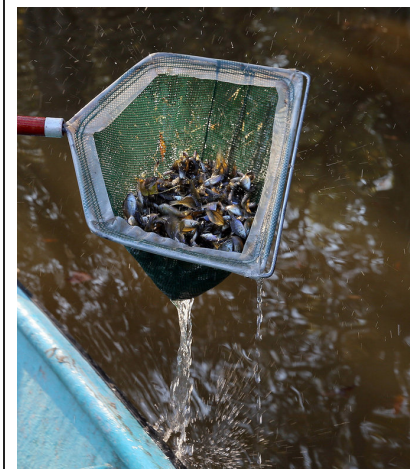
Restocking the West Pearl