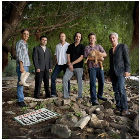
The Creole String Beans intermingle south Louisiana classics and vintage-sounding original material on 'Shrimp Boots & Vintage Suits.' The CD is a finalist for the nominees ballot of the 2013 Grammy Awards.